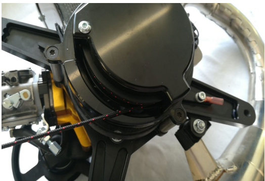
arc adapter finished in place