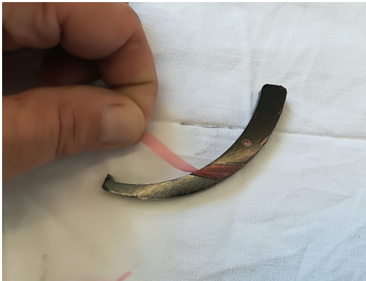
remove foil from sticky tape