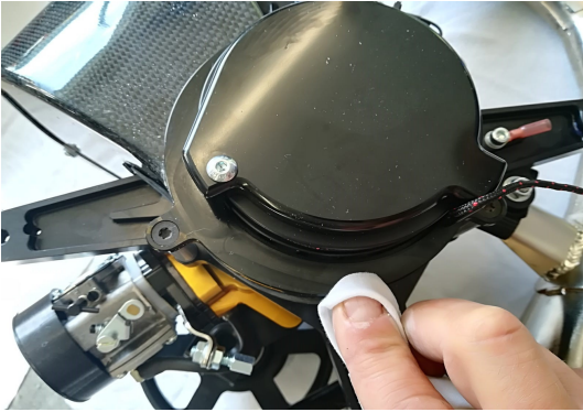
clean surface with solvent