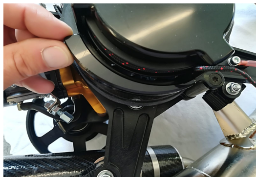
place part in correct position and well press it on for permanent glueing